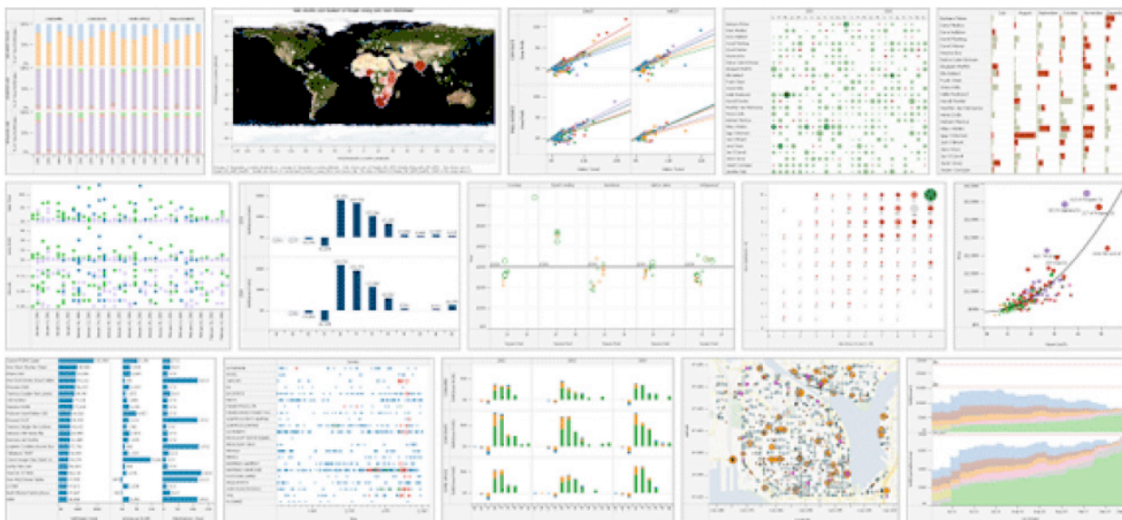
Figure 2. VizQL at work

Designers of Tableau deliberately restrict the set of supported visualizations to the popular and proven ones, such as tables, charts, maps, and time series, as doubting general utility of exotic visual metaphors (Hanrahan et al., 2007). Thereby, Tableau approach is constrained to generating grids of visual presentations of uniform granularity and limited dimensionality. Other researchers suggest that Visual OLAP should be enriched by extending basic charting techniques or by employing novel and less-known visualization techniques to take full advantage from multidimensional and hierarchical properties of data (Tegarden, 1999;